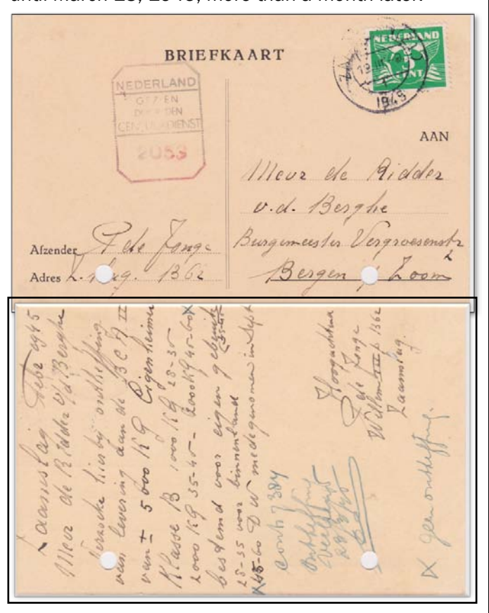
Figure 1. Zaamslag (ZL.) to Bergen op Zoom (NB.) March 1945.

The postcard shown here (Figure. 1) was written on February 9, 1945 (see back) and sent from Zaamslag (Zeeland Province) to Bergen op Zoom (NB.) It did not receive a Zaamslag (ZL.) postmark until March 13, 1945, more than a month later.