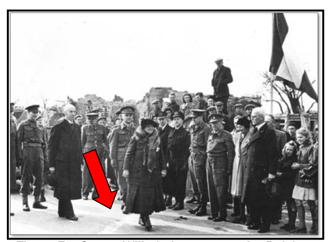
Figure 5. Queen Wilhelmina crosses the Belgian-Dutch border on March 13, 1945.