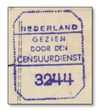
Figure 4. Dutch censorship marker

One has to realize that once parts of the Southern Netherlands were liberated (this included Zaamslag (liberated on September 19, 1944) and Bergen op Zoom (liberated October 27, 1944) it took a while to get the mail system going again. It was not until March 1, 1945 that mail could be sent to and from Bergen op Zoom again. The card probably was held back at the Zaamslag post office until it was permitted to be forwarded. Why it was not forwarded until March 13, and not March 1, I don't know.